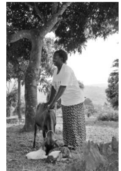
A Ugandan mother will be able to feed and clothe her family with proceeds from the two goats who were born moments before we arrived at her home.