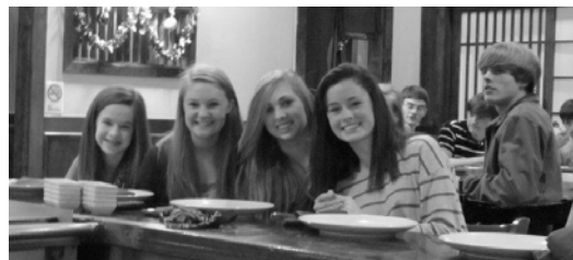
Sunday Night of Fun at Kiku's.